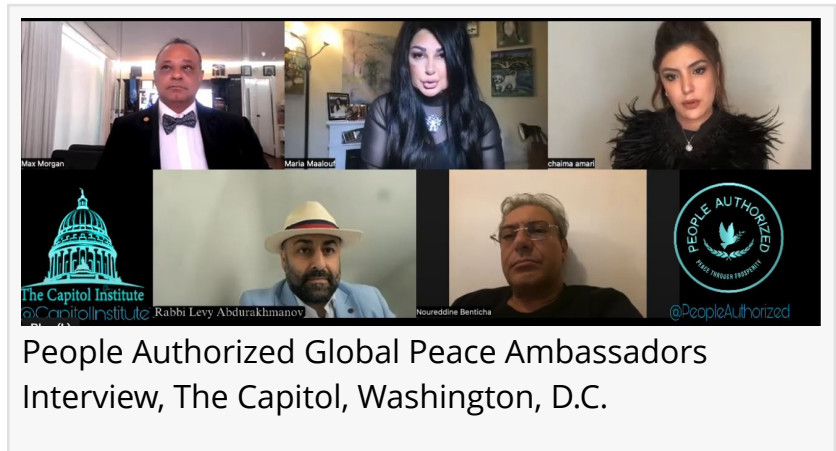
People Authorized Global Peace Ambassadors Interview, The Capitol, Washington, D.C.

WASHINGTON, D.C., USA, May 19, 2023 /EINPresswire.com/ -- DJERBA SYNAGOGUE TERRORIST ATTACK