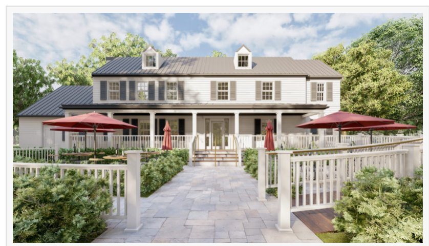
The Fully Renovated Salt & Vine Restaurant in Olney, MD

OLNEY, MD, UNITED STATE OF AMERICA, May 19, 2023 /EINPresswire.com/ -- Salt & Vine Restaurant in Olney, MD is proud to announce the long-awaited reopening of the historic Olney House, a Maryland landmark. After years of careful planning, restoration, and expansion, Salt & Vine Restaurant is thrilled to unveil the newly renovated Olney House, set to open in Spring of 2023.