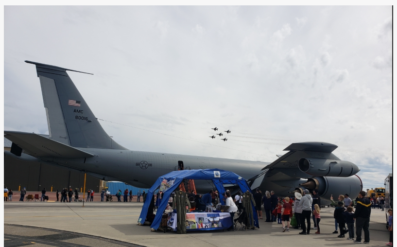
Captain Mama booth at KC-135 at Fairchild Air Force Base, Thunderbirds flying overhead

Ahead of the airshow, the author will perform inspirational, bilingual assemblies to serve students at three local elementary schools. Graciela selected schools with dual-language programs in the Beaverton and Hillsboro school districts to reward students pursuing bilingual education and the educators doing the extra hard work in two languages.