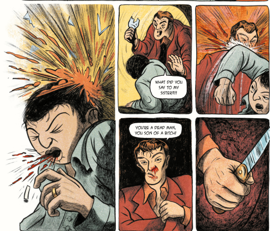
Capone becomes Scarface