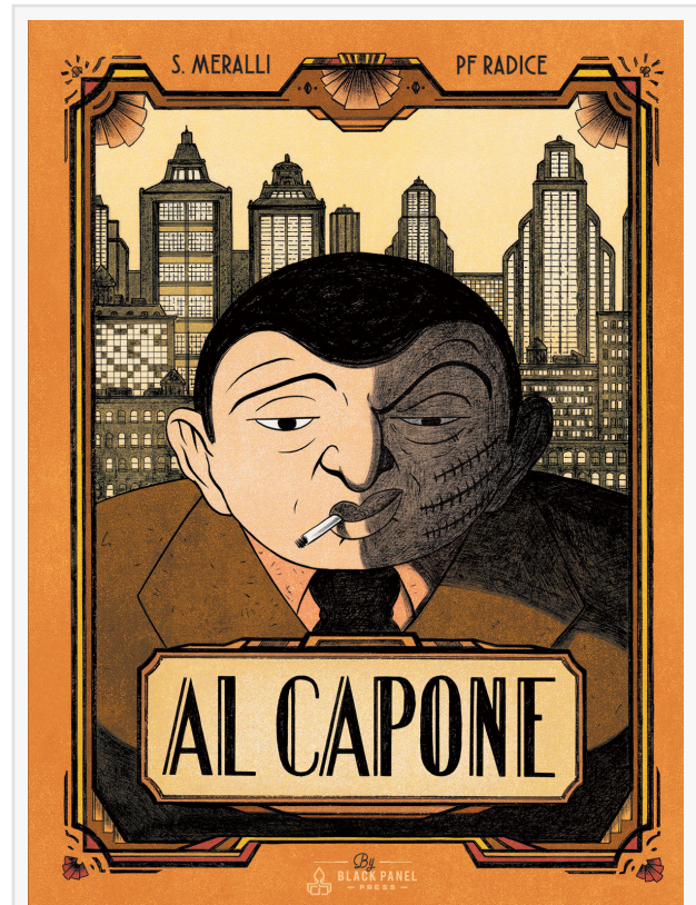
Al Capone Cover

Readers will be captivated by the engrossing narrative and vivid descriptions that bring Al Capone's world to life. Through the pages of this gripping biography, they will witness the thrilling cat-and-mouse game played between Capone and law enforcement agencies, including the pursuit by Eliot Ness and his Untouchables.