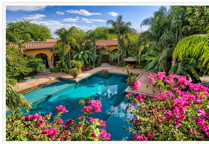
Hand-tiled saltwater swimming pool