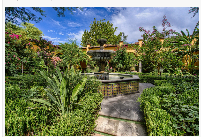
La Posta Vecchia-inspired estate with two courtyards