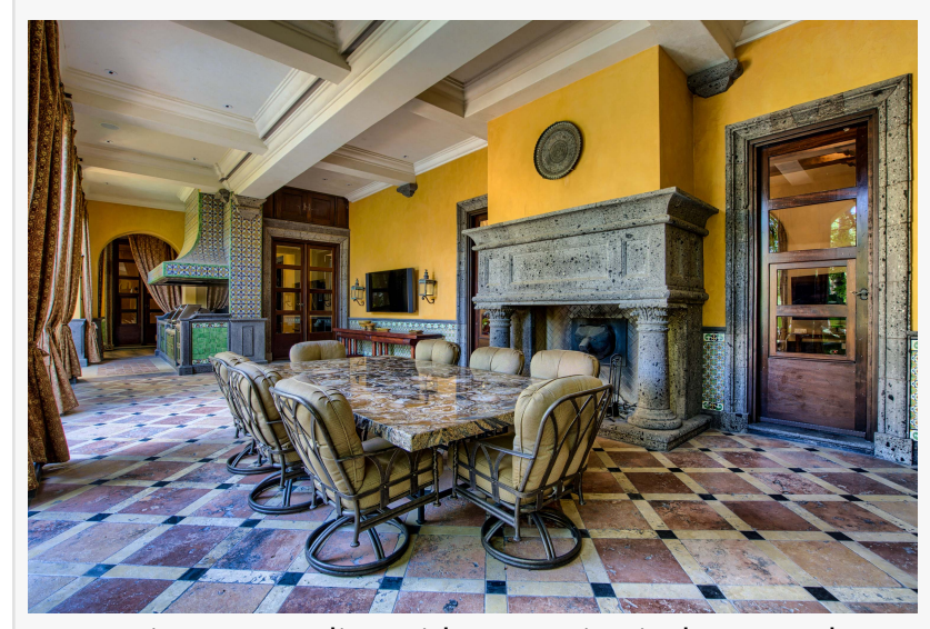
Entertainers paradise with extensive indoor-outdoor living spaces