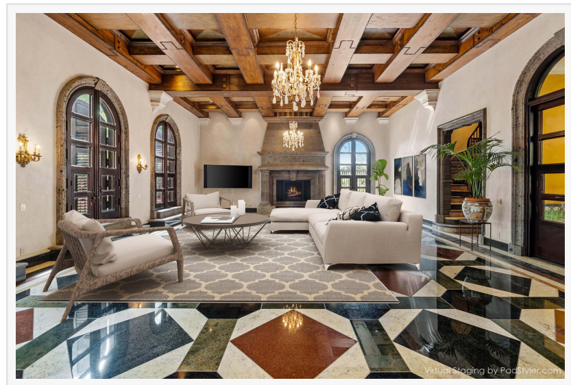
Exquisite, imported materials and artisan details

Concierge Auctions is the world's largest luxury real estate auction marketplace, with a state-of-the-art digital marketing, property preview, and bidding platform. The firm matches sellers of one-of-a-kind homes with some of the most capable property connoisseurs on the planet. Sellers gain unmatched reach, speed, and certainty. Buyers receive curated opportunities. Agents earn their commission in 30 days. Acquired by Sotheby's, the world's premier destination for fine art and luxury goods, and Anywhere Real Estate, Inc. (NYSE: HOUS), the largest full-service residential real estate services company in the United States, Concierge Auctions continues to operate independently, partnering with real estate agents affiliated with many of the industry's leading brokerages to host luxury auctions for clients. For Sotheby's International Realty listings and companies, Concierge Auctions