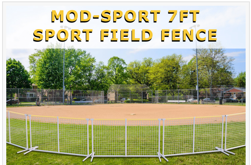
Mod-Sport 7ft Sport Outfield Fence