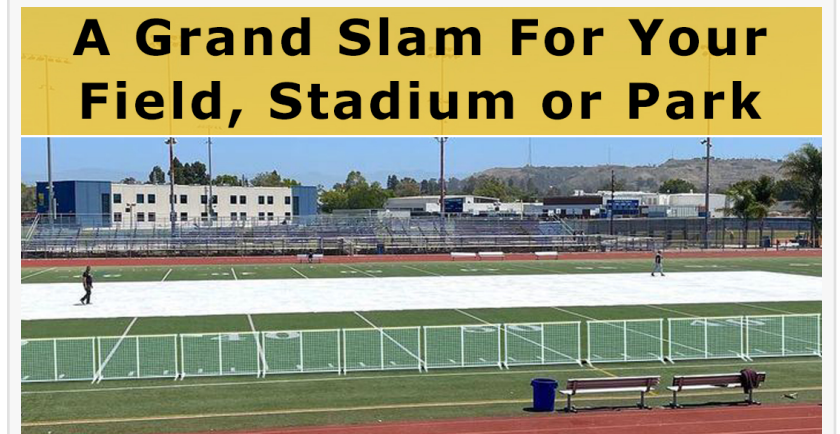
New 7ft Outfield Sport Fence System