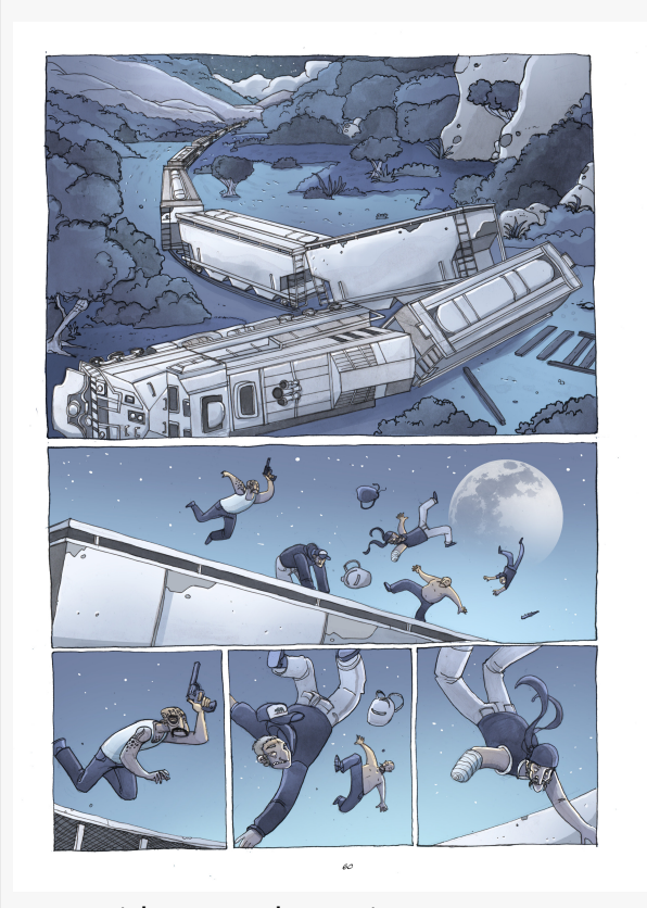
An accident on the train