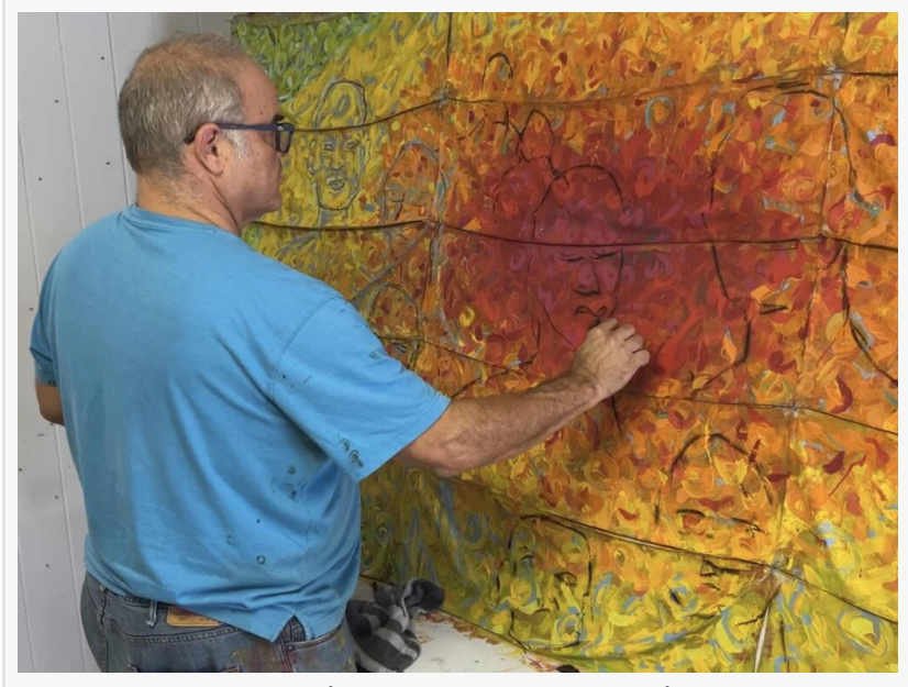
Artist Xavier Cortada painting Keep Cool

CORAL GABLES, FLORIDA, UNITED STATES, May 19, 2023 /EINPresswire.com/ -- The Coral Gables Museum is pleased to announce the launch of a special collaboration between local environmental artist Xavier Cortada, and MISSION, a leading provider of active wearable cooling designs. The project, called Keep Cool Miami-Dade, is a social practice campaign aimed at creating awareness on the effects of heat, climate change