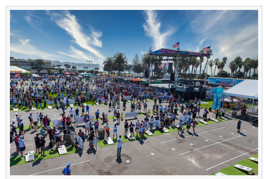
The Throw Down Cornhole Festival & Car Show

VENTURA, CALIFORNIA, UNITED STATES, May 24, 2023 /EINPresswire.com/ -- The nation's, and the world's, largest cornhole tournament returns to beautiful seaside Ventura on August 25 – 27. Sponsored by local favorite Spencer Makenzie's seafood restaurant, this California-classic multi-day party will feature the coast's best food, drinks, and live music, as well as DJs spinning