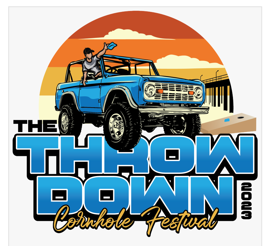
The Throw Down Cornhole Festival & Car Show Logo

For those who want to play cornhole just for fun, all festival attendees are invited to play for free on the open-to-the-public courts, in the midst of the excitement but without the high stakes. Players can also join non-tournament cash blind draw games to try their luck.