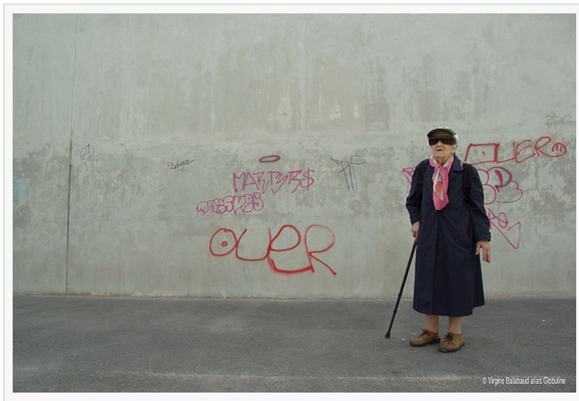
Scene from 'LITTLE PILE OF THINGS'