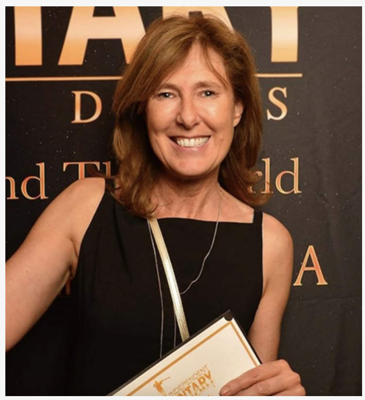
Virginie Balabaud, film director 'LITTLE PILE...'