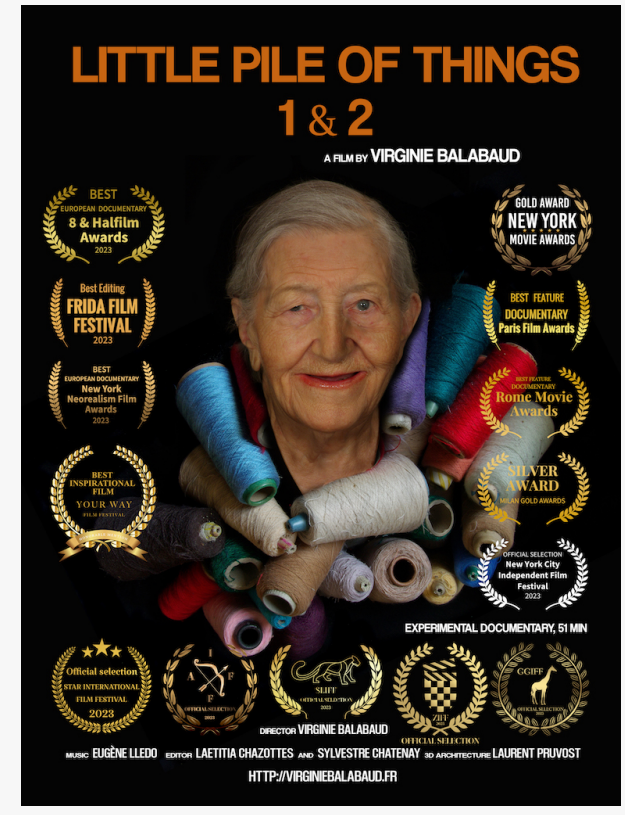
Poster2 'LITTLE PILE OF THINGS'

Dennis Cieri NYC Independent Film Festival +1 917-797-0816 email us here Visit us on social media: Facebook Twitter Instagram YouTube