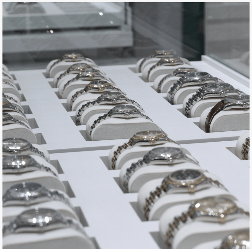
Some of JuraganJam's Watch Collection

The CEO further expanded on JuraganJam's commitment to its customers: "Our aim is not just to provide a transactional retail experience. We aspire to guide our customers on an insightful journey into the world of luxury watchmaking, understanding the rich heritage of different watch brands, the complex mechanics that govern these timepieces, and the factors contributing to their long-term preservation." More about JuraganJam's philosophy can be found on their About Us page.