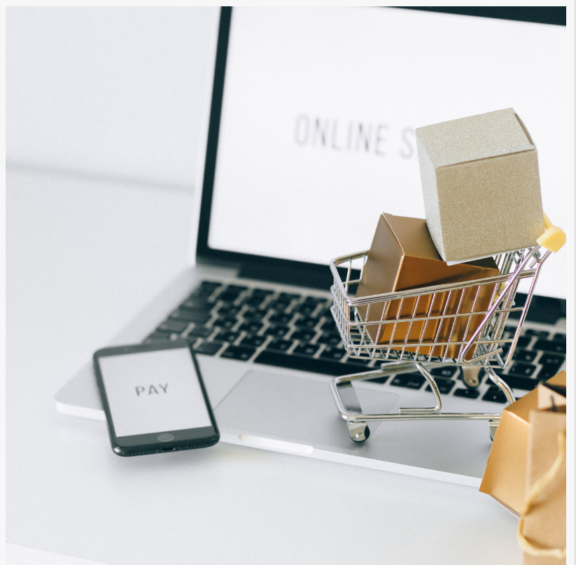
B2B & B2C Portal Management