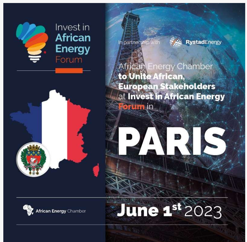
Invest in African Energy Forum