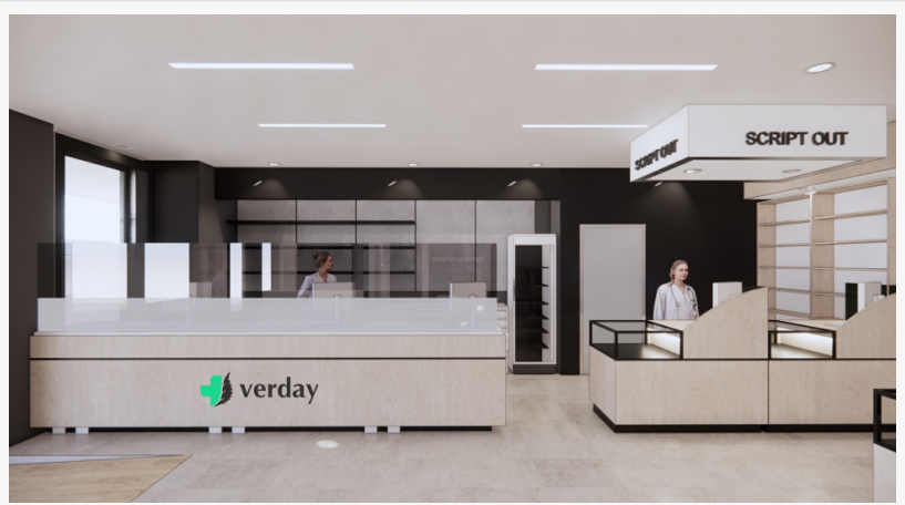
Verday Dispensary design

Visit us on social media: LinkedIn Instagram