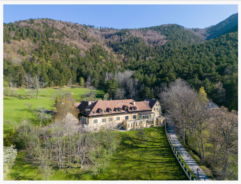
Luxury Sporting Estate | Near Vienna, Austria

68 Raven Road | Greenville, South Carolina Bidding Opens 16 June Listed at $3.49M. No Reserve.