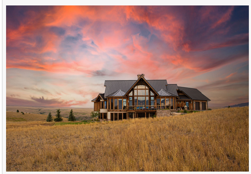
Ranches at Belt Creek | Montana