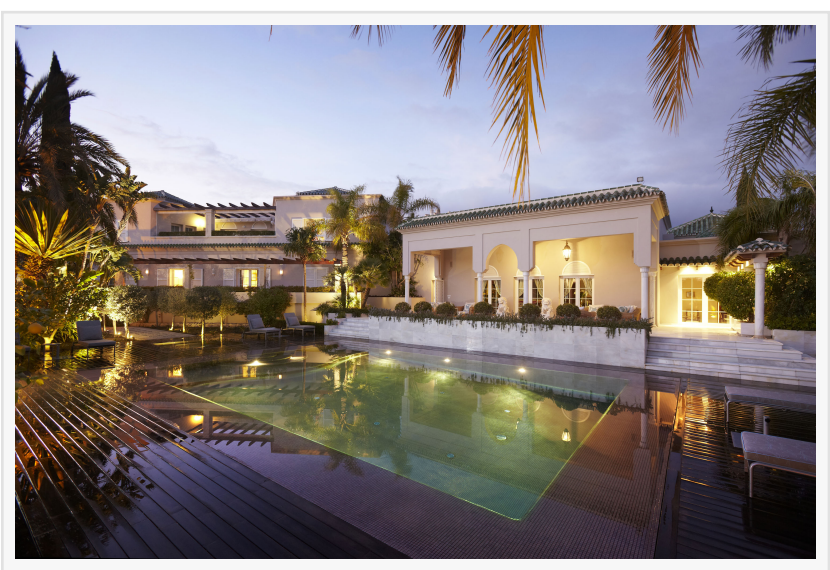
Prime Golden Mile | Marbella, Spain

NEW YORK, NEW YORK, UNITED STATES, May 22, 2023 /EINPresswire.com/ -- Announcing their upcoming auctions for May and June, the majority offered No Reserve, these properties represent some of the finest luxury real estate in the world. Escape to Spain's historic <u>Granja de Mirabel</u>, with its stunning mansion, chapels, and lush gardens, offering privacy, Gothic