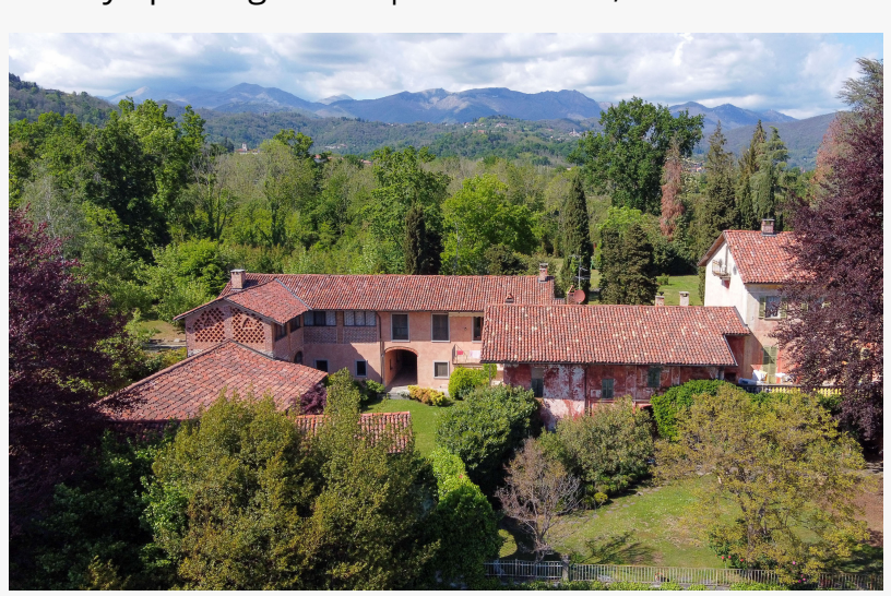
House of Cerruti | Biella, Piedmont, Italy