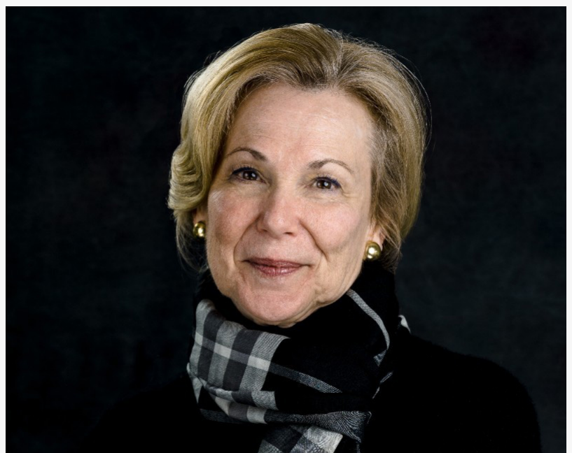
Deborah L. Birx, M.D. – Former White House Coronavirus Response Coordinator