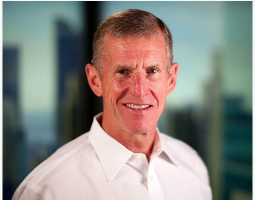
General Stanley McChrystal – Former commander of US and International Forces in Afghanistan

/EINPresswire.com/ -- More than 15,000 Scouts attending the Boy Scouts of America's 20th National Jamboree , from July 19-28, 2023, will have the opportunity to participate in “ Leadership Heights ,” a brand new multi-dimensional program designed to teach and reinforce personal leadership, which is one of Scouting's core values.