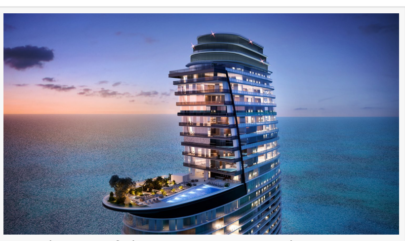
Outside View of The Aston Martin Residences in Miami

MIAMI, FL, UNITED STATES, May 22, 2023 /EINPresswire.com/ -- Aston Martin, the iconic automobile giant, renowned for its luxury and power, is set to unveil its first foray into the world of luxury real estate, <u>the Aston</u> <u>Martin Residences in downtown Miami</u>. This pre-construction development is now nearing completion, with a grand