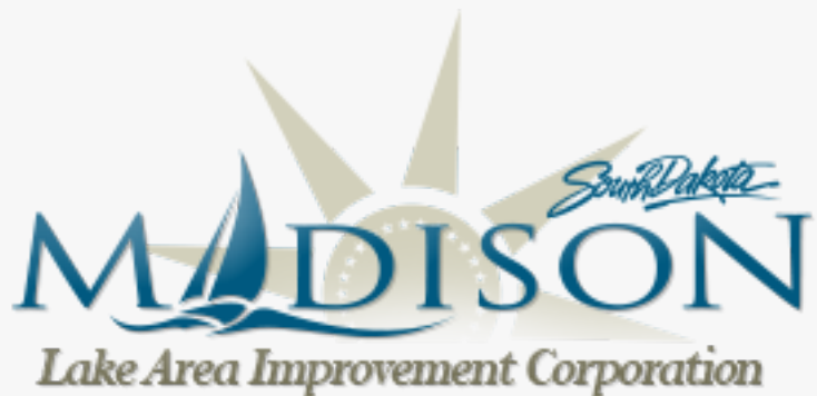
Lake Area Improvement Corporation - Madison, SD