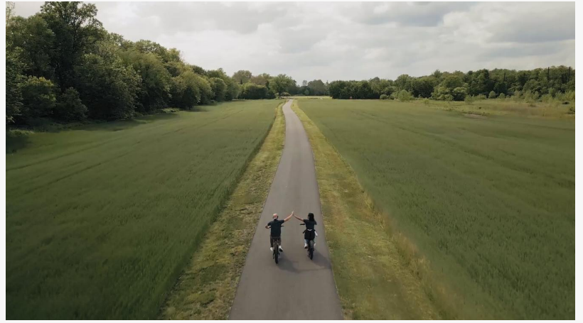
Discover Columbia Trail Riding

This press release can be viewed online at: https://www.einpresswire.com/article/635274368