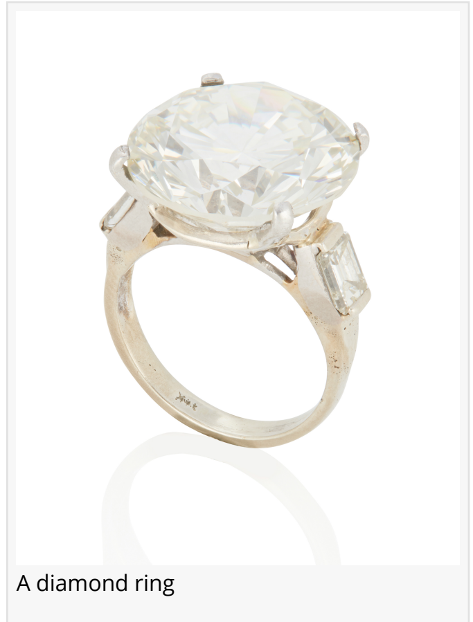
A diamond ring

Collectors of luxury timepieces can consider a Rolex President Day-Date II platinum wristwatch (lot #65; estimate: $30,000 – $40,000). The auction house notes that this ref. 218206 watch remains in very good condition. Rolex introduced the Day-Date watch in 1956. It was the first