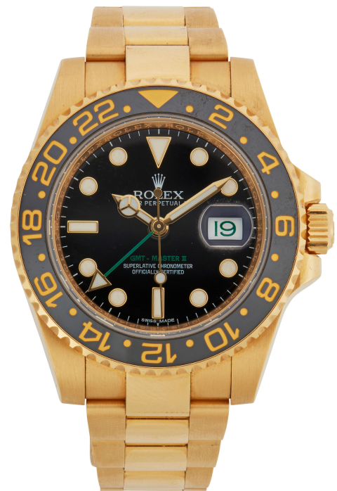
A Rolex GMT-Master II gold wristwatch