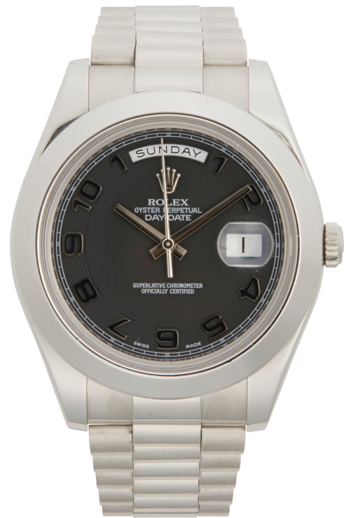
A Rolex President Day-Date II platinum wristwatch

https://www.bidsquare.com/online-auctions/john-moran/a-john-hardy-cinta-collection-gem-set-shell-bracelet-4975989