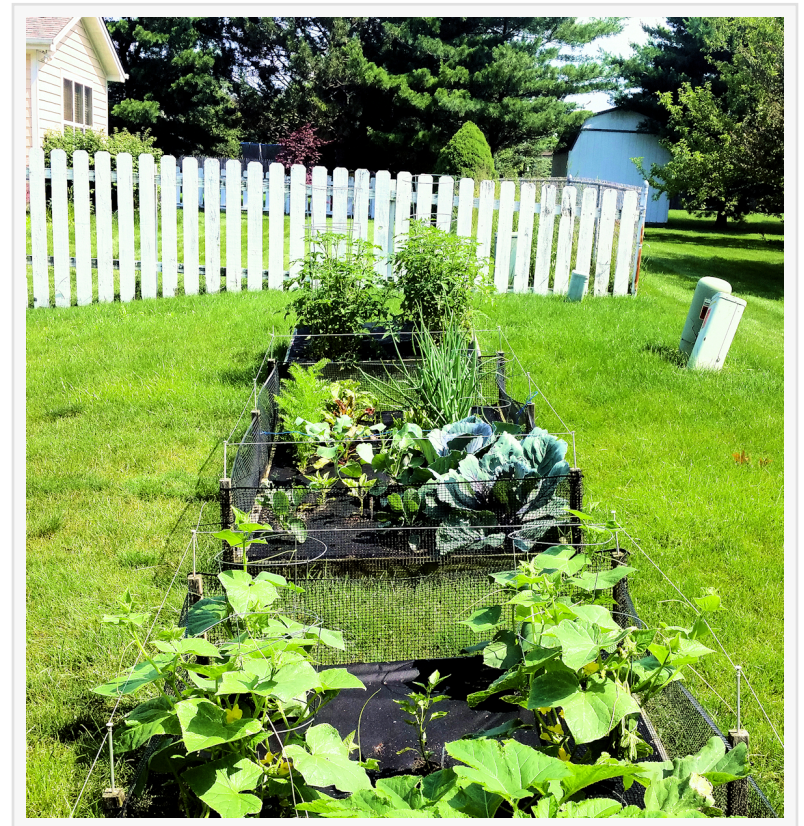
Who needs an expensive lawn when you can grow healthy food?

WALNUT CREEK, OHIO, UNITED STATES, May 23, 2023 /EINPresswire.com/ -- Frustrated by rising food costs and supply chain disruptions, a growing number of urban families are digging up their backyards and planting vegetable gardens and fruit trees. These new converts to "micro-homesteading" are learning that peace of mind and healthy food are not difficult to achieve. Who needs an expensive lawn when you can fill your refrigerator with wholesome food... right from your back yard? Its easier than you think.