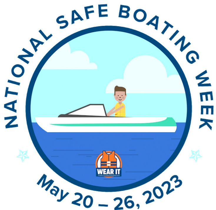
National Safe Boating Week