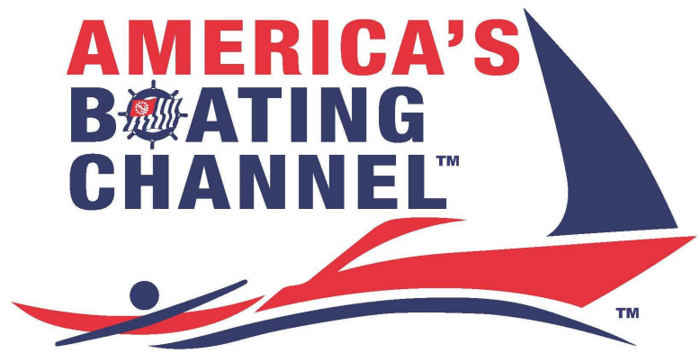
America's Boating Channel

America's Boating Channel™ is produced for United States Power Squadrons® (USPS) by Lafferty Media Partners (LMP) under a grant from the Sport Fish Restoration and Boating Trust Fund, administered by the U.S. Coast Guard. The service features professionally produced, high-definition, safe boating and boater education videos, along with boating themed entertainment and informational television programs. America's Boating Channel has been recognized with the National Boating Industry Safety Award as the 2021 Top Marine Media Outlet, and with the 2022 International Boating and Water Safety Summit Communication Award for the top Video Public