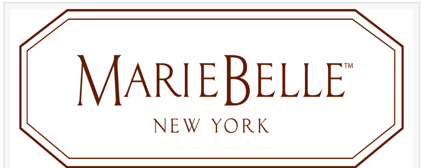
Mariebelle Chocolate Logo