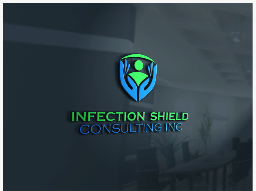
Infection Shield Consulting Inc.

This powerful tool's key features include easy record-keeping, instant reporting, and a real-time