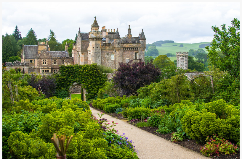
Travels through Scotland mean storied castle keeps.