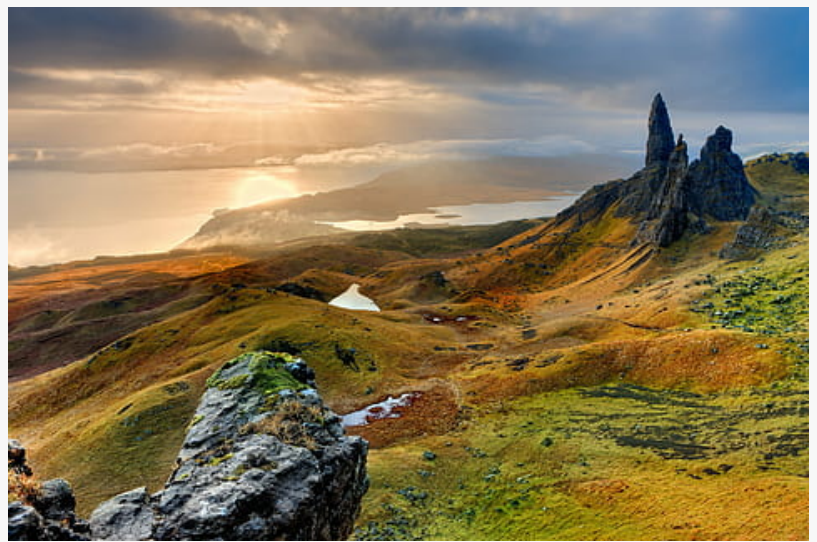
Travel-in-Spirit heads to Scotland and Ireland in October for a spirited journey like no other.

Information: Travel-in-Spirit.com , questions@travel-in-spirit.com .