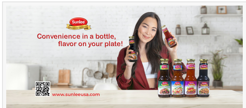
The New Best 4 Convenient Sauces