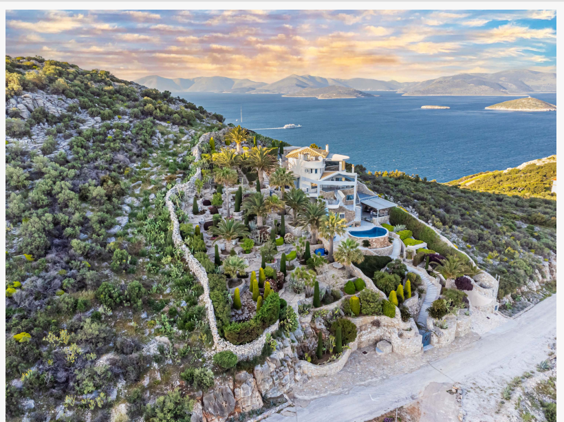
Gated Mediterranean villa on a quarter acre

Architecturally designed to capture views from every room, this expansive gated villa sits on nearly a quarter acre. An open floor plan, oversized windows, and eight-meter ceilings are ideal for hosting a crowd. Two dining rooms and a wine room provide options for every kind of gathering. Embrace the sea air with the pull of the multi-level outdoor living space. The terrace offers something for everyone, with areas for alfresco dining, open-air yoga, and poolside lounging. Meticulous landscaping can be found around every turn of the stone paths,