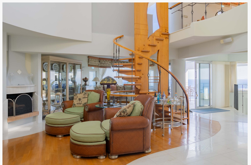
Aegean oasis, an hour from Athens