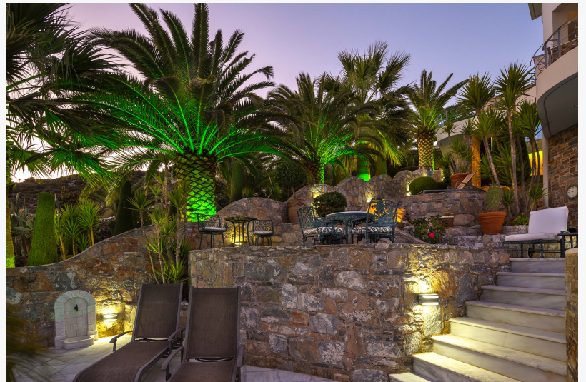
Terraced outdoor living & entertaining