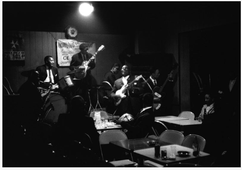
Scene from 'BORN IN CHICAGO'