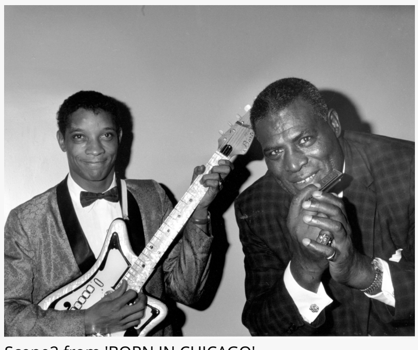
Scene2 from 'BORN IN CHICAGO'

This press release can be viewed online at: https://www.einpresswire.com/article/635542625