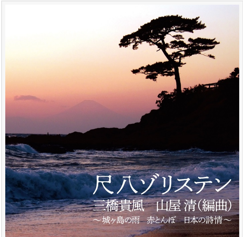
Sound of Shakuhachi - Jougashima No Ame / Aka Tonbo