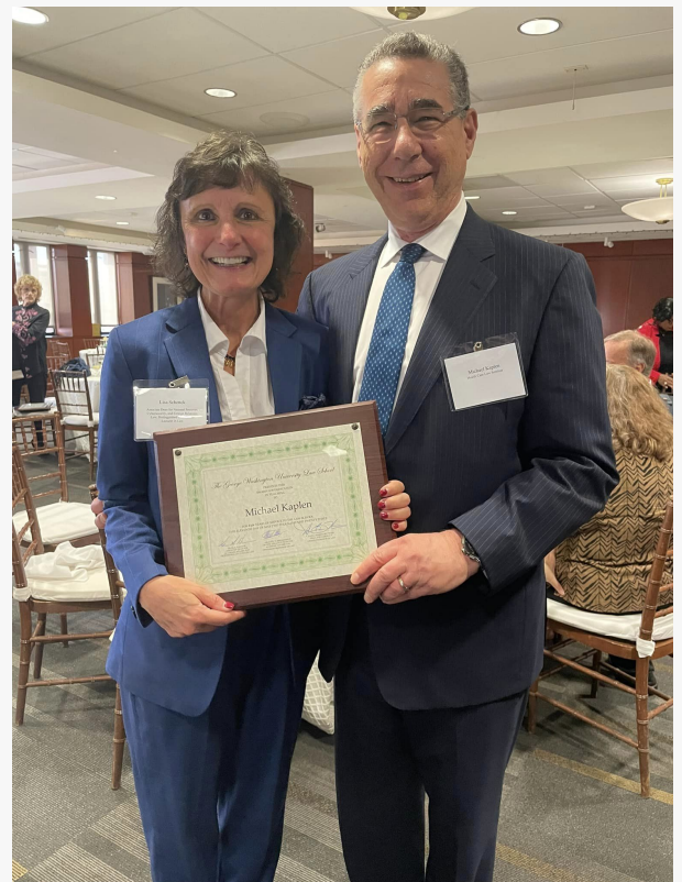
Presentation of award