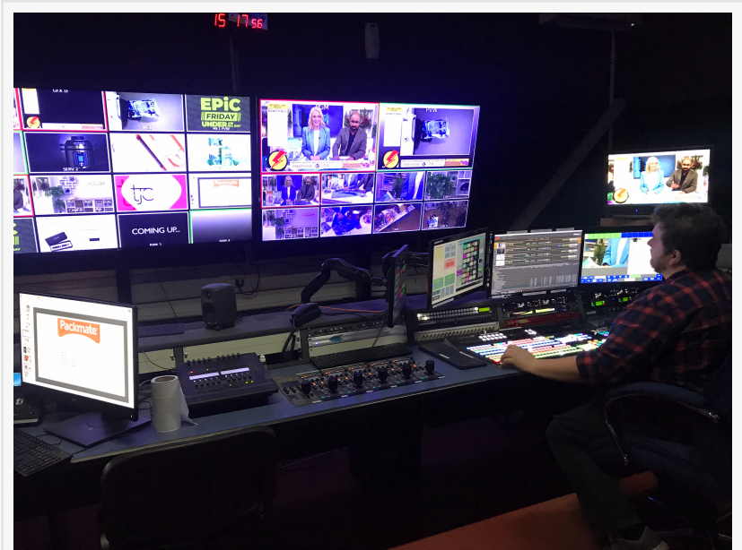
Preventing downtime, Dejero GateWay established solid, secure connectivity for a multitude of devices at TJC

Not only did a Dejero EnGo mobile transmitter provide resilient wireless connectivity in place of TJC's inhouse encoders to push live video to YouTube, the low-latency solution also ensured the falling-price auction-style home shopping channel could provide dynamic graphics and pricing updates from an offsite location, that could be uploaded and changed live on air by TJC