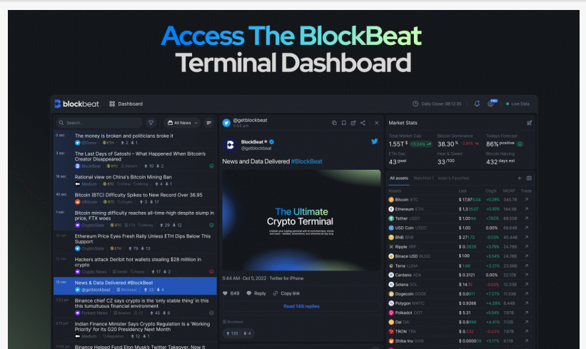
The Main Terminal Dashboard

with the necessary insights to make informed decisions in the rapidly evolving world of blockchain and cryptocurrency. This includes real-time news from major news sources, crypto-native news sites, press releases from important government bodies, and full Medium articles