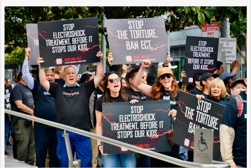
Protestors confront those attending the American Psychiatric Association (APA) convention in San Francisco.