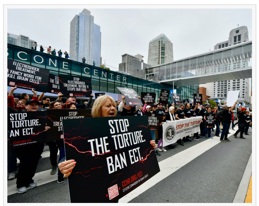
Citizens Commission on Human Rights demands an end to ECT

LOS ANGELES, CALIFORNIA, UNITED STATES, May 24, 2023 /EINPresswire.com/ -- Hundreds protested outside the American Psychiatric Association (APA) convention in San Francisco over the APA's ongoing support for the use of electroshock. The protest was organized by Citizens Commission on Human Rights (CCHR), a mental health industry watchdog headquartered in California, where electroconvulsive therapy (ECT), has been banned from use on children under 12. CCHR,