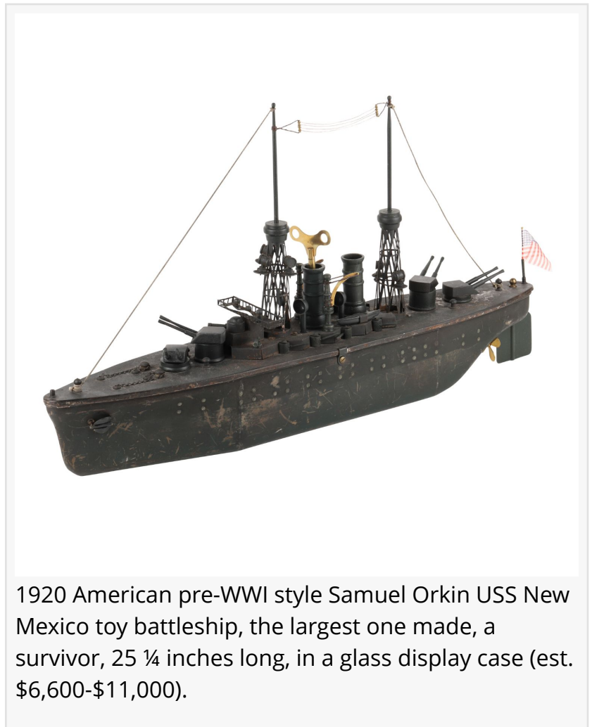
1920 American pre-WWI style Samuel Orkin USS New Mexico toy battleship, the largest one made, a survivor, 25 ¼ inches long, in a glass display case (est. $6,600-$11,000).