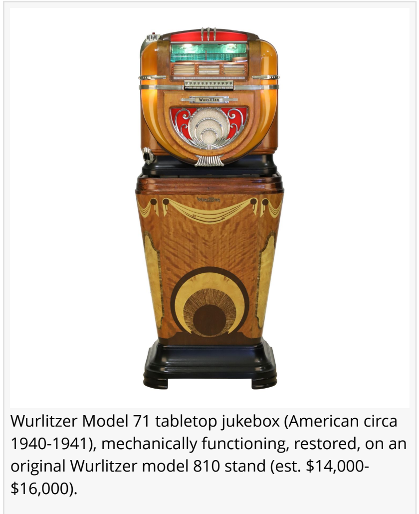
Wurlitzer Model 71 tabletop jukebox (American circa 1940-1941), mechanically functioning, restored, on an original Wurlitzer model 810 stand (est. $14,000-$16,000).