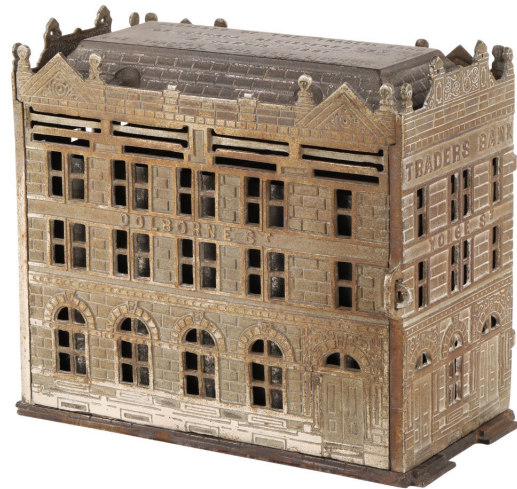
Traders Bank of Canada architectural still bank, made in Canada in the 1890s from nickel-plated cast iron, with inner compartments and ephemera (est. $2,000-$2,500).

This press release can be viewed online at: https://www.einpresswire.com/article/635631983 EIN Presswire's priority is source transparency. We do not allow opaque clients, and our editors try to be careful about weeding out false and misleading content. As a user, if you see something we have missed, please do bring it to our attention. Your help is welcome. EIN Presswire, Everyone's Internet News Presswire™, tries to define some of the boundaries that are reasonable in today's world. Please see our Editorial Guidelines for more information. © 1995-2023 Newsmatics Inc. All Right Reserved.