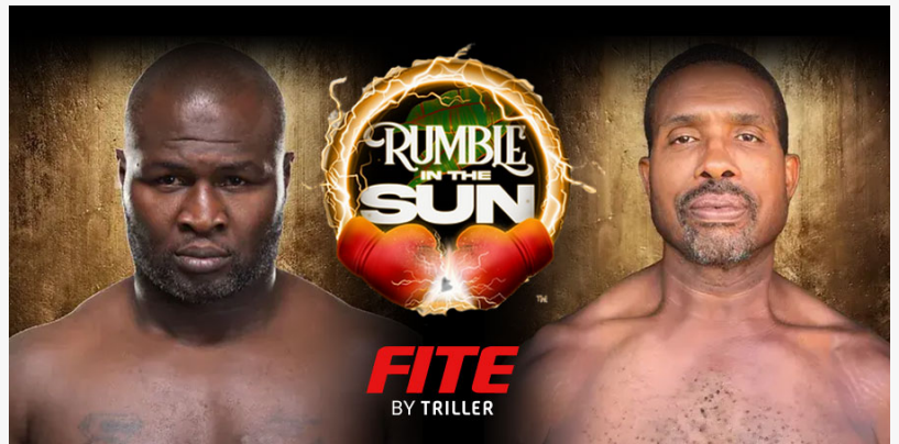
James "Lights Out" Toney and Donovan "Razor" Ruddock