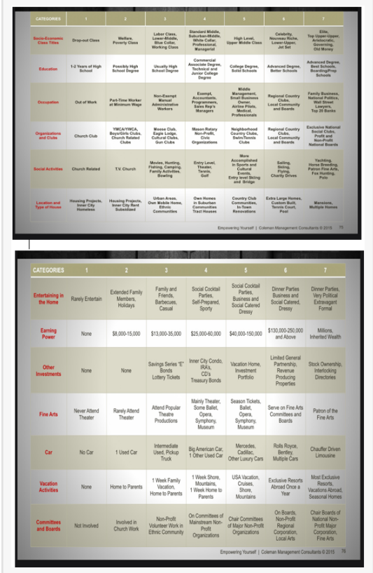
LIFESTYLE CHARTS will tell you where you started in life, and where you currently are but most importantly, will allow you to choose the stage where you want to eventually end.

Empowering Yourself: The Organizational Game Revealed, The Best Kept Secret in Organizational America, tells why their career might be slowing or have hit a "glass ceiling." For the first time, the "unwritten rules" that define how the organizational system works have finally been written down for all to see. Whether their definition of success is increased credibility in their current assignment or moving up the organizational ladder, this book will give them the knowledge to make the proper decisions to accomplish their goals.