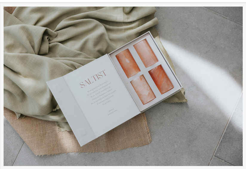
100% Himalayan Salt Tequila Glasses: 4 Pack

BRONTE, NEW SOUTH WALES, AUSTRALIA, May 25, 2023 /EINPresswire.com/ -- Introducing Saltist, 100% Himalayan Salt Tequila Shot Glasses. Ethically sourced from the Himalayan Mountains in Pakistan, these classy & conscious glasses, will add a nuanced salty note to every sip of tequila - in style, and without the mess.