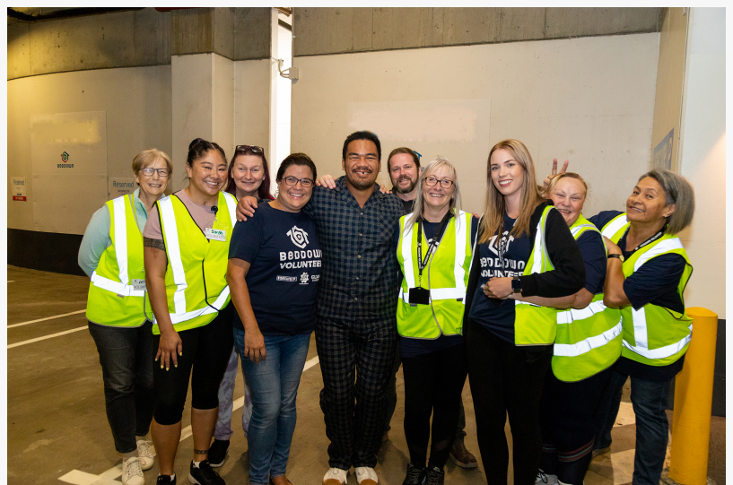
Brisbane Beddown Venue

The Change47 campaign offers multiple ways to get involved, including