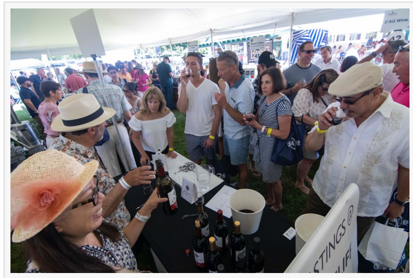
Crush WineXP's North Fork Crush returns to LI Wine Country. The annual tasting includes 100+ wines, craft beverages, artisan foods, plus a special VIP area (ticket upgrade applies) offers reserve and estate wines and appetizers for pairing; 6/17, Peconic Bay Vineyards.

North Fork Crush Wine & Artisanal Food Festival tickets are on sale now, ranging from $55 to $100, depending upon ticket level and time of purchase. Additionally, a Designated Driver ticket is available at $24 and includes non-alcoholic beverage and food sampling. Check the website for current ticket information and availability. Guests