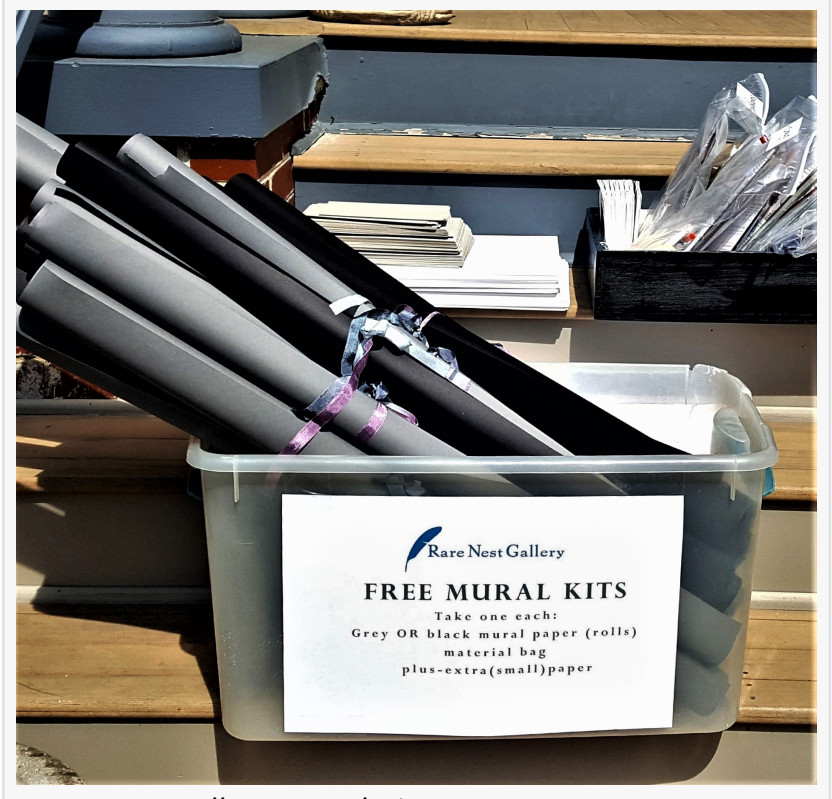
Rare Nest Gallery Mural Kits