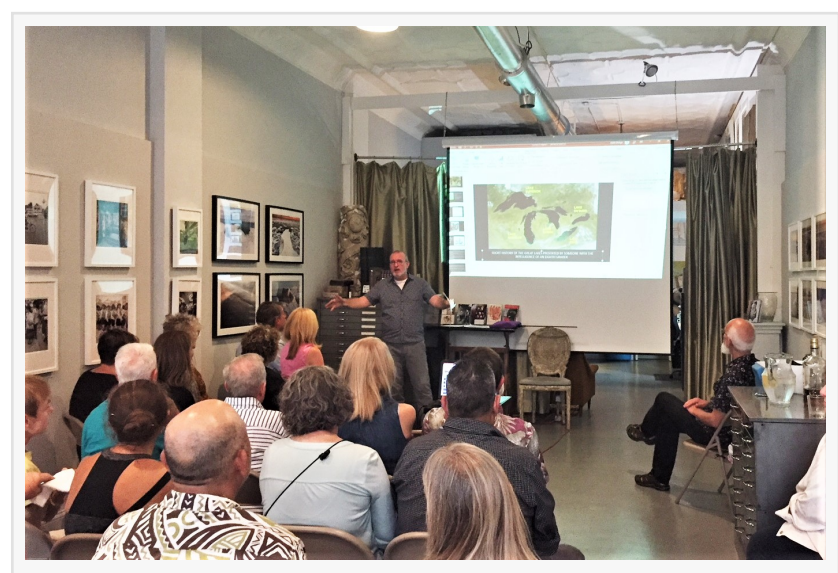
Rare Nest Gallery Presents Lectures Films Receptions

Located in Chicago's Avondale neighborhood, Rare Nest Gallery opened in the Fall of 2017. Since then, the Gallery has mounted 19 major exhibitions and produced over sixty events including the world premiers of documentary films and music along