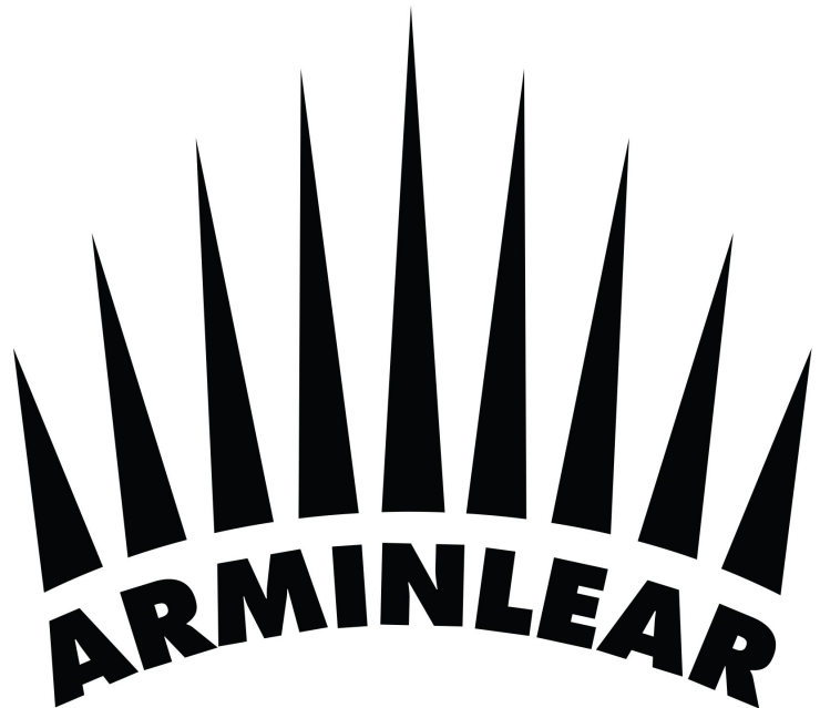
Armin Lear Press logo