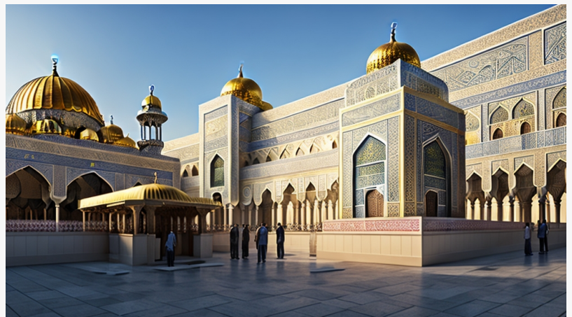
Design concept for Haj Bhavan in india