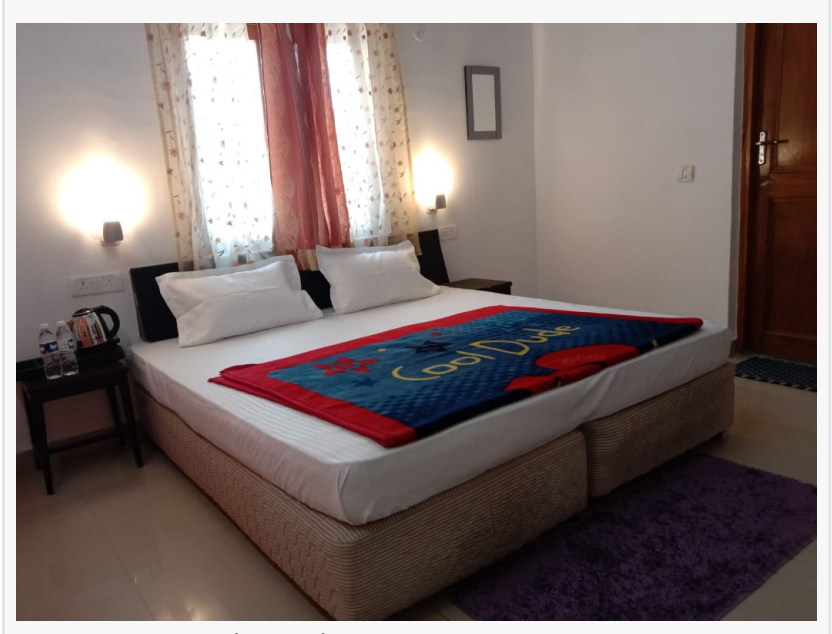
Homestay in Bhimtal

engage their taste buds in the local dishes while enjoying views of the Bhimtal Lake, serving a memorable experience. For relaxation and rejuvenation, Seven Cozy Stay organizes a lot of