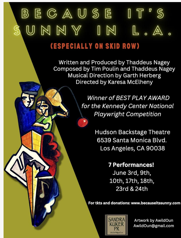
Poster of "Because It's Sunny In L.A. (Especially On Skid Row)"

$35 for V.I.P. Premium Seating with a special program (Front rows, first two rows center). $30 General Admission $25 for Seniors/Students/Veterans with ID at box office, one hour prior to showing.