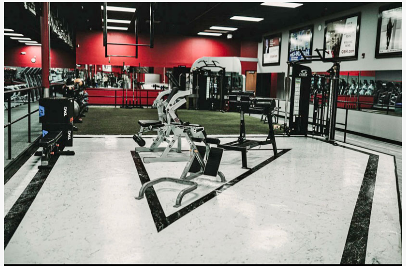
New MarbleFlex gym floor