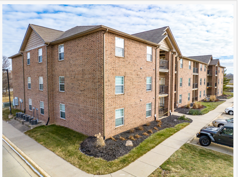
Student housing building that is part of the 22-acre property.