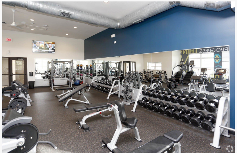
Fitness center at Village West.

This press release can be viewed online at: https://www.einpresswire.com/article/635874056 EIN Presswire's priority is source transparency. We do not allow opaque clients, and our editors try to be careful about weeding out false and misleading content. As a user, if you see something we have missed, please do bring it to our attention. Your help is welcome. EIN Presswire, Everyone's Internet News Presswire™, tries to define some of the boundaries that are reasonable in today's world. Please see our Editorial Guidelines for more information. © 1995-2023 Newsmatics Inc. All Right Reserved.