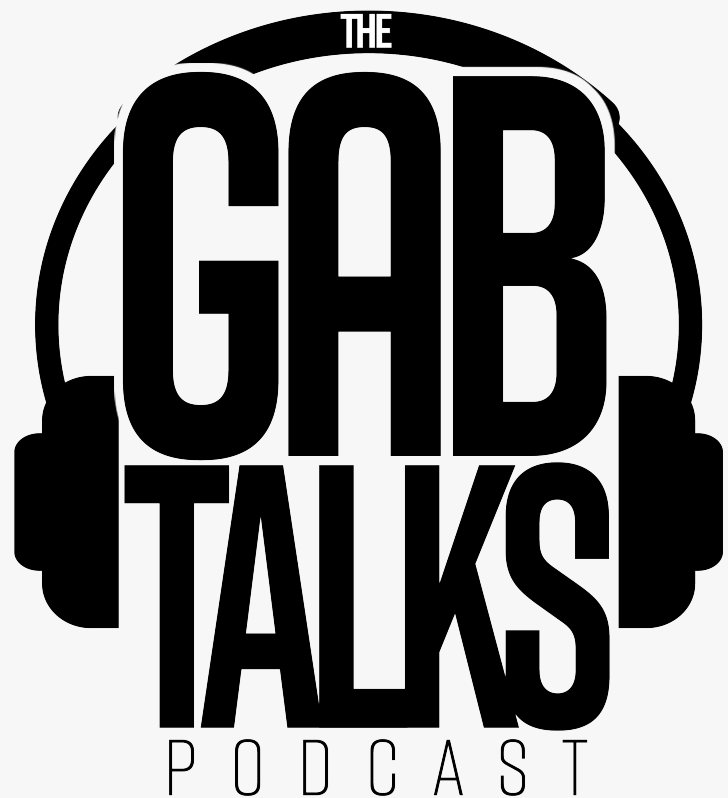
The GAB TALKS podcast