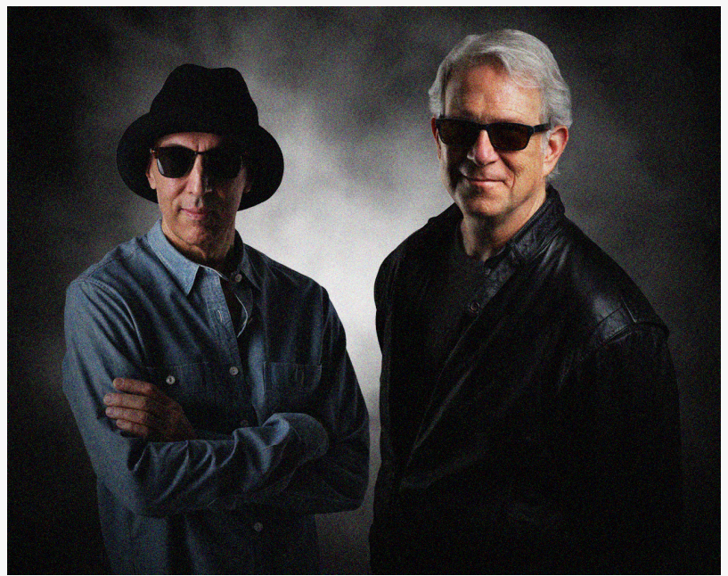
Foundry Town Survivors

BG Gebhardt Foundry Town Music +1 734-635-4357