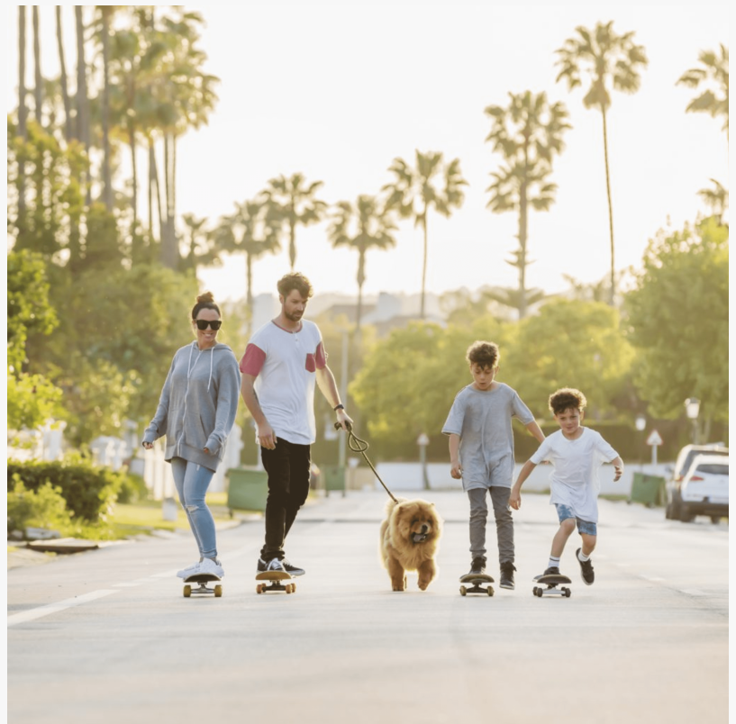
Living in Marbella lets you enjoy your time with friends and family