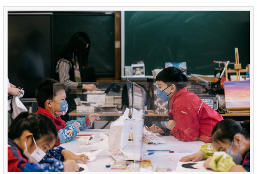
Students attending workshops & creating their artworks in our partnering school

TUEN MUN, NEW TERRITORIES, HONG KONG, May 27, 2023 /EINPresswire.com/ -- Wonders Initiatives, a NGO dedicated to promoting integration of art and technology in education, is delighted to present an eagerly anticipated exhibition 'Unmasked Smile' with support by one of the city's major property developers Sino Group. 'Unmasked Smile' is the first exhibition of its kind in Hong Kong dedicated to